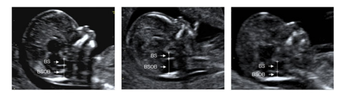
Figure 1 Midsagittal view of the fetal brain at 12 weeks' gestation demonstrating the measurements of BS diameter and BSOB diameter in a normal fetus (left), one with triploidy and a posterior fossa cyst (middle) and one with trisomy 18 and spina bifida (right)

Sonographic studies have reported that a cyst in the posterior fossa in early pregnancy can be a transient finding in normal fetuses,<sup>20,21</sup> but it has also been described in association with subsequently diagnosed Dandy–Walker malformation.<sup>22,23</sup> A study involving ultrasound examination of the brain of 31 live births with trisomy 18 reported that the most common brain lesion was cerebellar hypoplasia, which was observed in 32% of the cases.<sup>24</sup> Another clinical and subsequent pathological