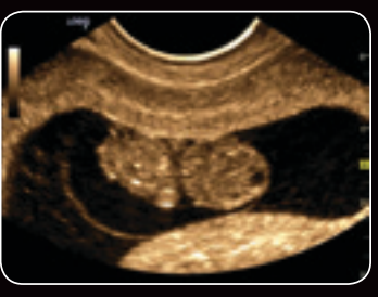
Ovary 9W Fetus