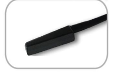
7.5MHz Linear Rectal L50617S-S