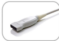
7.5MHz Linear L30617S