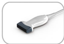
7.5MHz Linear L40617S