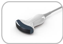
3.5MHz Convex C60613S