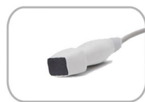
3.0MHz Phased array P3