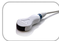
3.0MHz Mirco-Convex C20613S