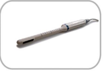
7.5MHz Transrectal L40617S-REC