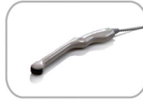
6.0MHz Transvaginal C12616S