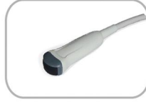
6.0MHz Mirco-Convex C15616S